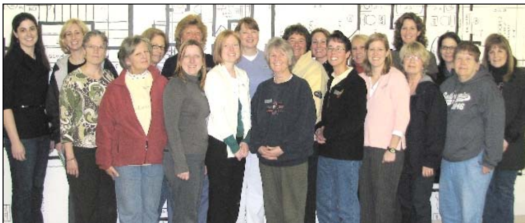
New steering committee members have volunteered to organize the 2009 WB home.