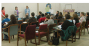
Family Services workshops will be held at Habitat’s main offices, except where noted.

“Kids’ workshops will occur at the same time and place as the training their parents are completing,” explained Miller. “Our hope is that this will aid families who struggle to find child care, and teach the kids the valuable tools their parents are also learning!”